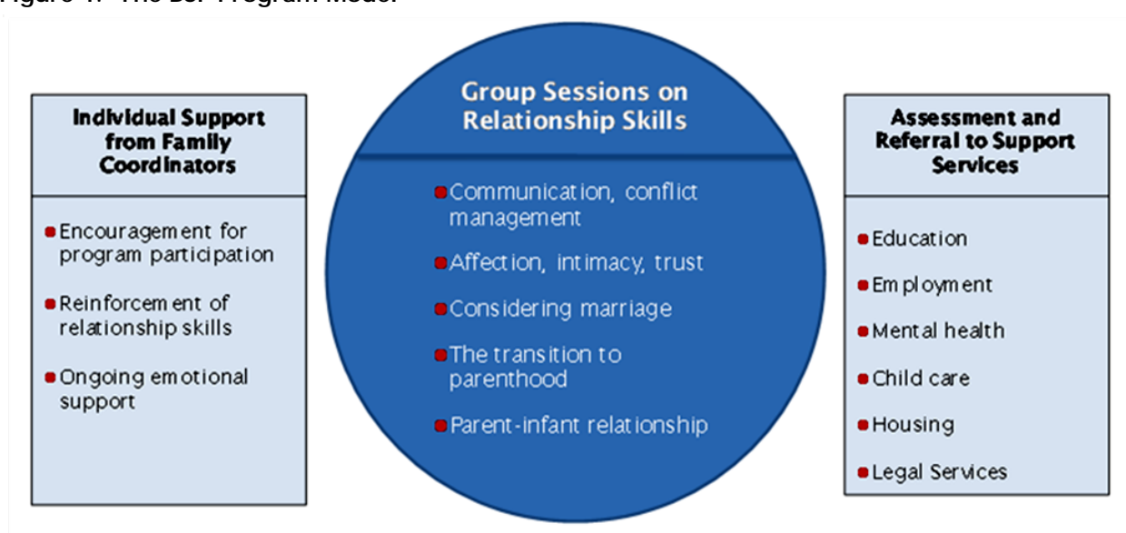
Figure 1. The BSF Program Model

The core component of BSF was curriculum-based group education on relationship skills (Figure 1). The BSF model did not require a specific curriculum, but it did require that the group sessions use a curriculum that covered key topics such as communication, conflict management, and marriage. Three curricula were developed for the eight BSF programs by experts who tailored their existing curricula for married couples to the needs of unmarried parents (Table 1). These curricula varied in the total hours of group sessions offered and the specified ideal group size. Group sessions usually met weekly but the formats differed. Sessions ranged in length from two to five hours, with shorter sessions typically held on weeknights and longer sessions held on weekends. Depending on the format and the number of hours of instruction offered, the curriculum could take as little as six weeks or as much as five months to complete. The program in Oklahoma City chose the Becoming